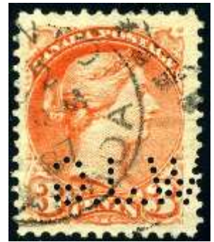
Earliest Reported Canadian Perforated Stamp, dated 1887

According to Post Office records, 80 applications have been approved since 1910. For a detailed listing, see Addendum A. The number in each year is as follows: 1910-twelve; 1911-eleven; 1912-twenty; 1913-eight; 1914-six; 1915-four; 1917-two; 1920-three; 1922-one; 1923-three; 1924-one; 1925-two; 1926-two; 1927-one; 1928-one; 1931-two. Since 1931 there has only been one approval although the regulations remain in force.