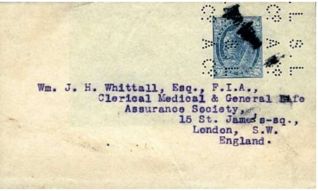
Earliest Reported Canadian Perforated Stationery.